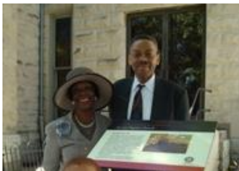
African American Heritage Trail: Database and signs featuring African American history in DC.