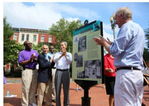
DC Neighborhood Heritage Trails: DC's official walking trails honor community heritage in 17 neighborhoods.