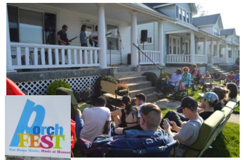
PorchFests: Music in the 'hood. Live performances on porches, sidewalks & at storefronts.