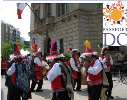
Passport DC: A month-long salute to international culture in the nation's capital.